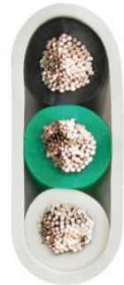
10 AWG FLAT