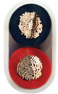
8 AWG FLAT