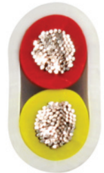
10 AWG FLAT