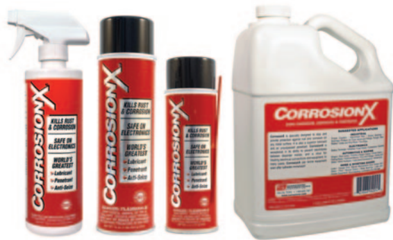
16 oz. Trigger Spray 91002 16 oz. Aerosol 90102 6 oz. Aerosol 90101 Gallon 94004

Polar Wire Products is an authorized distributor for Corrosion Technologies. For the complete line of CorrosionX® products, visit www.corrosionx.com