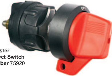
Master Disconnect Switch Part Number 75920