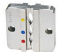
Crimps 22-10 AWG heat shrink terminals