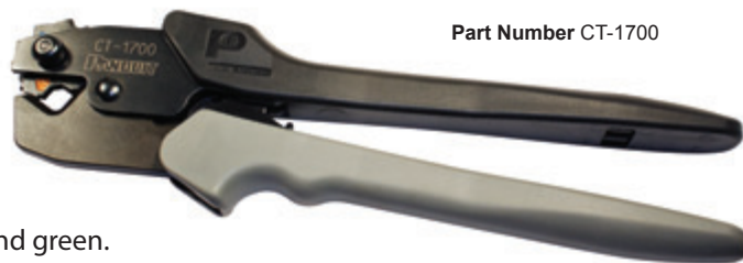
Part Number CT-1700

The Contour Crimp controlled cycle ratchet crimping tool crimps 8 to 1 AWG copper lugs and splices, 6 to 4 AWG aluminum lugs and splices, and 8 to 2 AWG non-insulated S Series tubular terminals. The rotary die-wheel locks easily into position with a push-button mechanism. Each die is embossed with die-code color. Nest includes red, blue, gray, brown, and green.