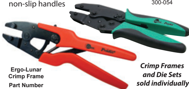
Ergo-Lunar Crimp Frame Part Number 300-096