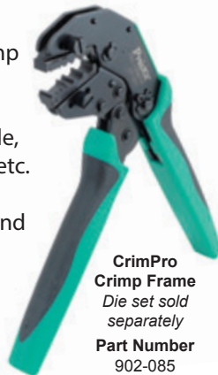
CrimPro Crimp Frame Die set sold separately Part Number 902-085