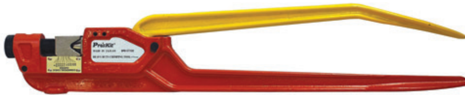
Part Number 300-107