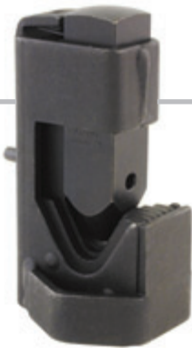
Part Number 94840

This Heavy Duty Hammer Crimp is a compact and durable tool for crimping lugs and terminals from 6 AWG to 4/0. Made of high strength steel, the hammer crimp tool features a V-shaped nest for a solid crimp each time with the simple swing of a hammer. A terminal and lug size guide lets you know the crimp is complete.