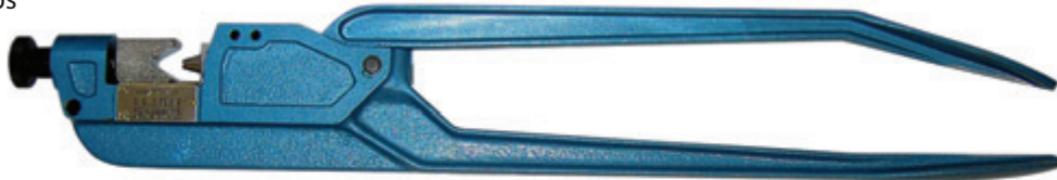
Part Number MT-25