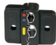
Crimps 22-10 AWG nylon insulated terminals