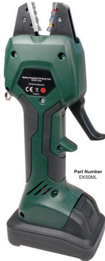
Part Number EK50ML

Many more dies available soon. Contact us!