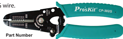
Part Number 200-010