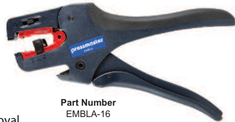
Part Number EMBLA-16