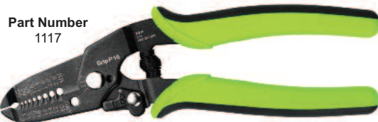
Part Number 1117