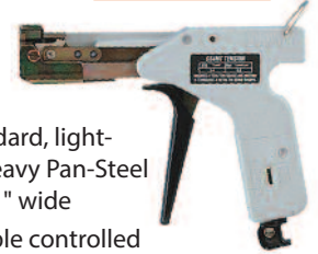
Part Number GS4MT