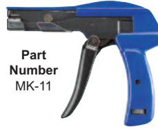
Part Number MK-11