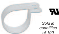
Sold in quantities of 100

Cable Clamps Service Kits available on page 85