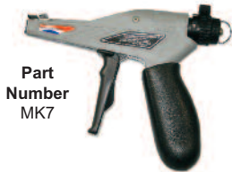
Part Number MK7