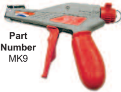
Part Number MK9