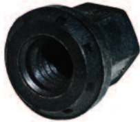
SN-B Black Plastic