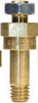
SMB-A7 Brass Bolt Extender Length: 1.835"