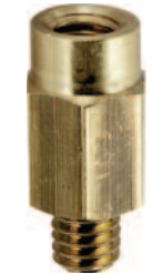
CB-TMBB Top Mount Brass Bolt, Small 3/8-16 x 1.10"