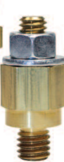
STC912 Brass Stud Assembly Length: 1.525"