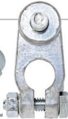
PSTC Post to Stud Converter Terminal