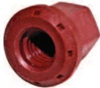
SN-R Red Plastic