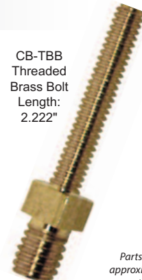
CB-TBB Threaded Brass Bolt Length: 2.222"