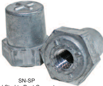
SN-SP Lead Stud to Post Converters Positive and Negative Sold as set