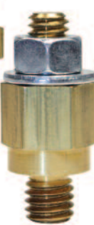
STC912 Brass Stud Assembly Length: 1.525"