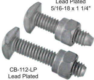
CB-112-LP Lead Plated 5/16-18 x 1 1/2"