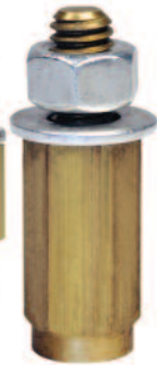
6025 1/4" - 20 Adaptor Nut Length: 1.625"