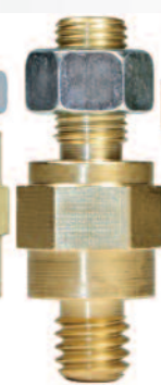
SMB-A6 Brass Bolt Extender Length: 1.735"