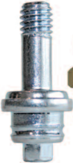
SMB-L Zinc-plated Steel OEM Long Bolt Length: 1.695"