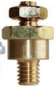
SMB-A 3/8" Brass Accessory Bolt Length: 1.455"