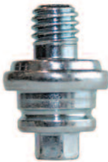
SMB Zinc-plated Steel OEM Bolt Length: 1.340"