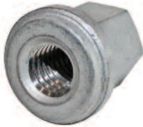
SN-SS Stainless Steel