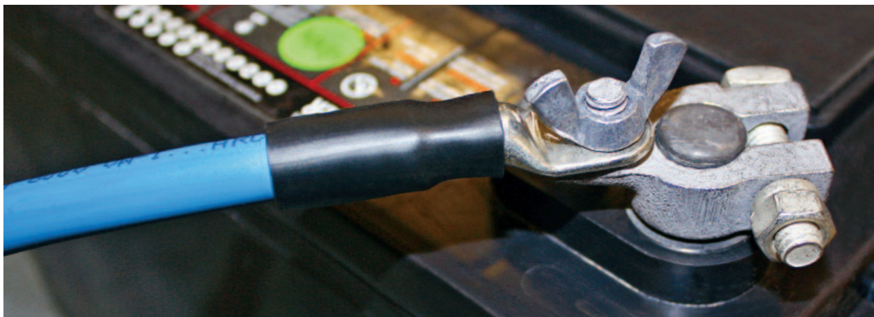
Parts shown actual size