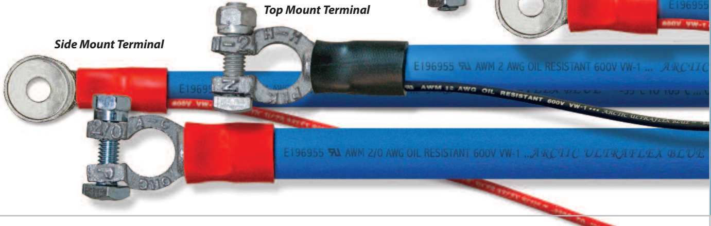
Side Mount Terminal