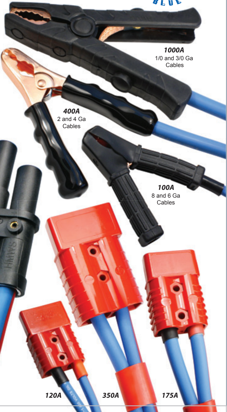
1000A 1/0 and 3/0 Ga Cables