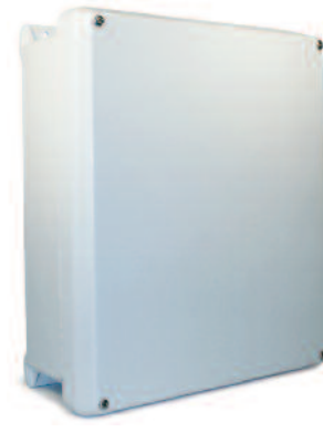
Corner Screw Cover