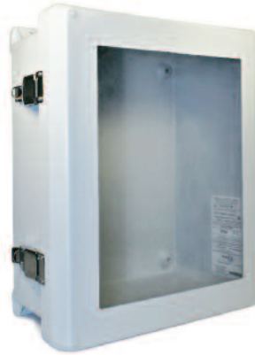
Bonded Window Cover