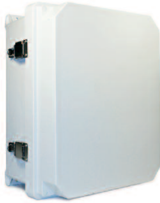
Raised Opaque Cover