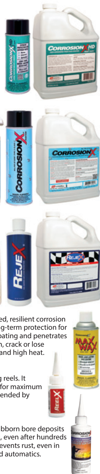
4 oz. 50010

CorrosionX® for Guns cuts through stubborn bore deposits for better cleaning, and decreases fouling, even after hundreds of rounds. Lubricates mechanisms and prevents rust, even in wet weather. Ideal for semiautomatics and automatics.