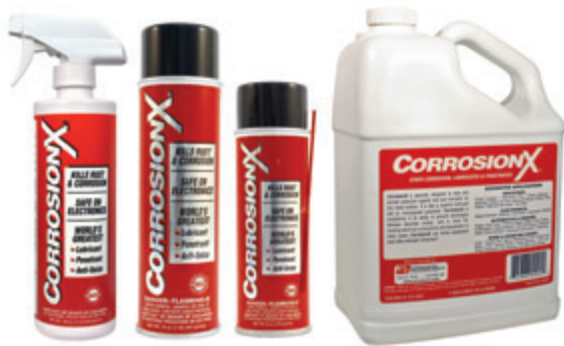
16 oz. Trigger Spray 91002 16 oz. Aerosol 90102 6 oz. Aerosol 90101 Gallon 94004

Polar Wire Products is an authorized distributor for Corrosion Technologies. For the complete line of CorrosionX® products, visit www.corrosionx.com