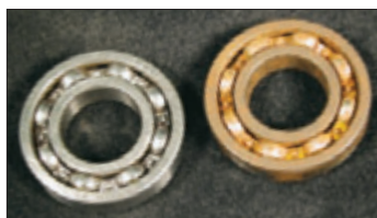
The bearing on the left was treated with CorrosionX; the one on the right was left untreated. Both were sprayed with seawater every day for two weeks. Note the remarkable difference.

CorrosionX® Heavy Duty forms a dripless, non-hardening, self-healing film that stubbornly resists removal by splash or spray—even full saltwater immersion. It penetrates rust and corrosion, removes moisture, stops electrolysis, then seals.