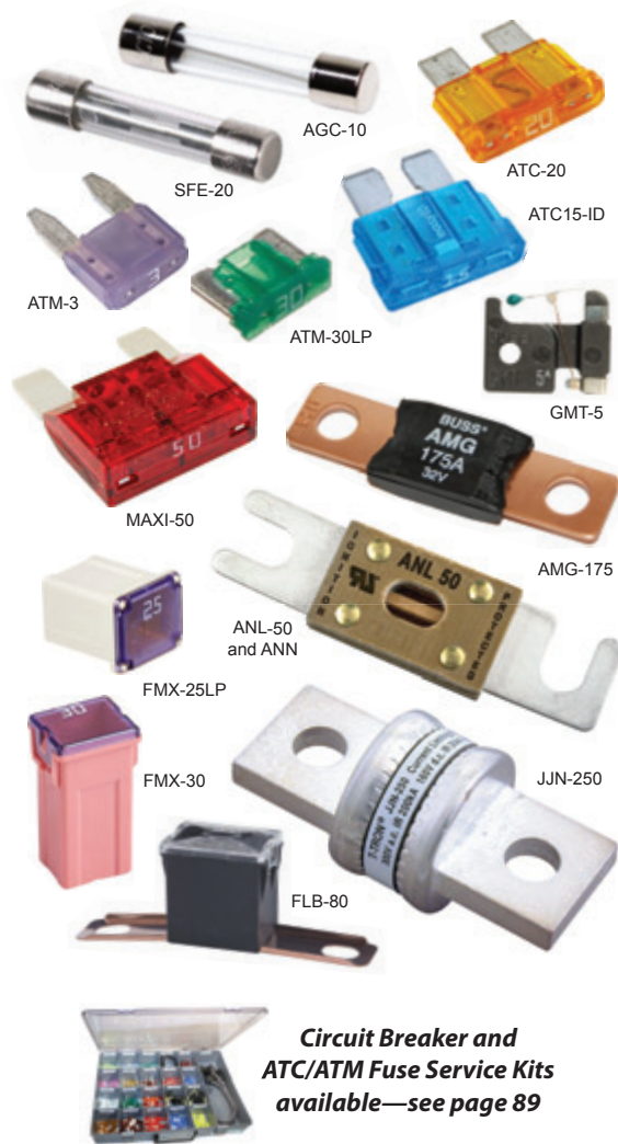
Circuit Breaker and ATC/ATM Fuse Service Kits available—see page 89

More fuse styles and sizes available online! Look for ABC, MDA, FRS-R, KLM, KTK and other Bussmann® fuses at store.polarwire.com