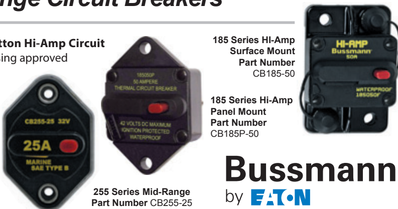
255 Series Mid-Range Part Number CB255-25

255 Series Switchable Manual Trip Push-Button Mid-Range Breakers are rated from 10 to 50 amps. Use in marine, agriculture, construction, RV, chassis and specialized equipment market applications.