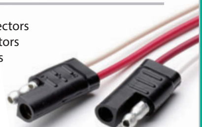
2-Pole Socket and Plug Part Number 11172

Automotive Trailer Connectors Farm Equipment Connectors Tractor-Trailer Connectors 1- to 6-Pole Connectors Socket and Plug Interiors