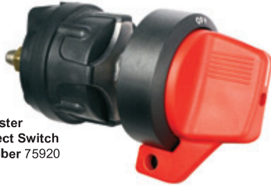
Master Disconnect Switch Part Number 75920