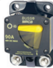
90A Surface Mount Part Number 7143