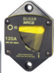
120A Panel Mount Part Number 7046