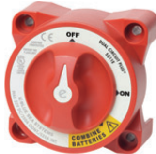
Part Number 5511E