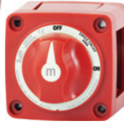
Part Number 6006