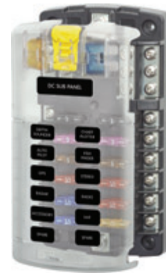
12 circuits with negative bus Part Number 5026