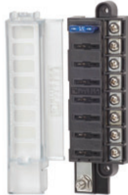
8 common course circuits Part Number 5046