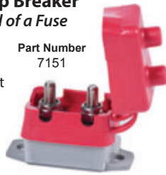
Part Number 7151