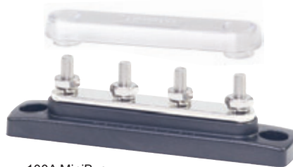
100A MiniBus 4 Gang #10-32 Studs Part Number 2305