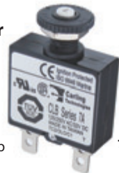
7A Part Number 7053