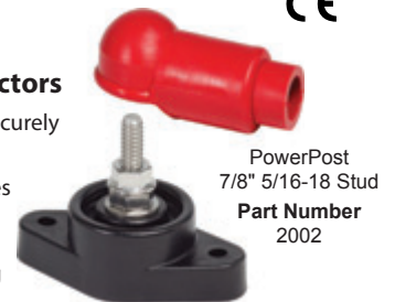
PowerPost 7/8" 5/16-18 Stud Part Number 2002