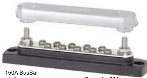
150A BusBar 10 Gang Part Number 2301