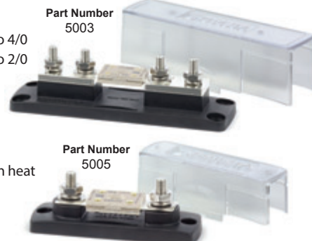
Part Number 5003