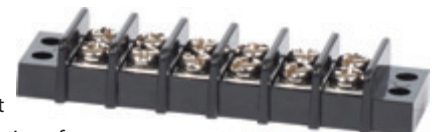
20A 6 Circuit Terminal Block Part Number 2408