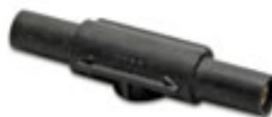
Part Number: CLMMM