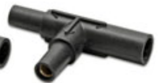
Part Number: CLMTT

CLM Series Couplers & T connectors accepts wire from 8 AWG to 2 AWG, and accepts up to 150A / 600V.