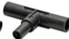
Part Number: CLMPT