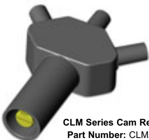
CLM Series Cam Reducer Part Number: CLMAD3F 400A / 600V (Male) to 150A / 600V (Female) Male/Female/Female/Female

To Order: Base Part Number Color CLMADFF - X