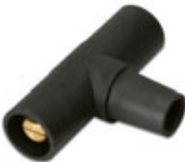
Paralleling T - Male/Male/Female Part Number: CPT