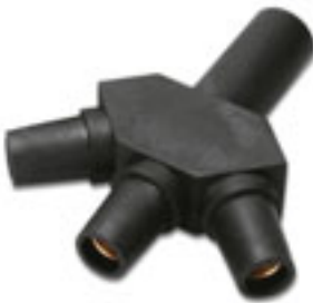
Hard 3 Line Tap Male/Female/Female/Female Part Number: CA3F