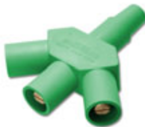
Reverse Hard 3 Line Tap Female/Male/Male/Male Part Number: CA3M