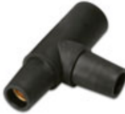
Tapping T - Male/Female/Female Part Number: CTT