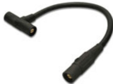
Soft Paralleling T - Male/Male/Female Part Number: CPTFST