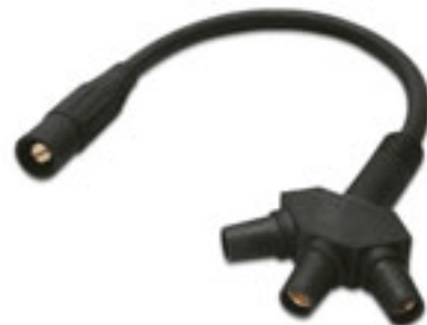
Soft 3 Line Tap Male/Female/Female/Female Part Number: CA3FST